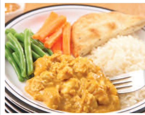
Chicken Korma served with Rice, Naan Bread & Seasonal Vegetables