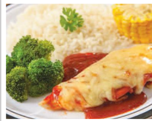
BBQ Chicken served with Rice & Seasonal Vegetables