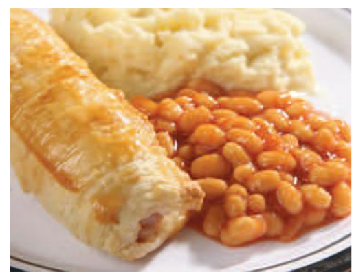
Homemade Sausage Roll served with Mashed Potato & Baked Beans