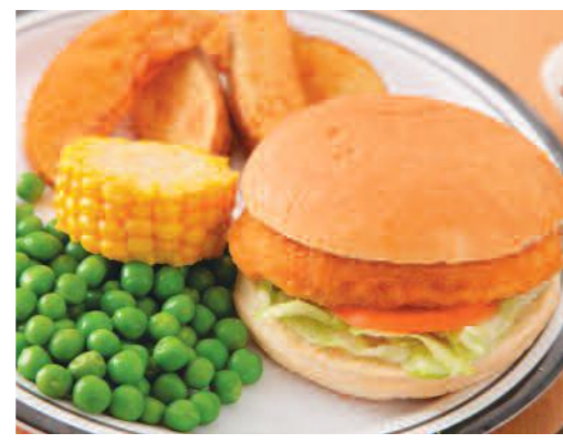
Crispy Chicken Burger served in a Bun with Potato Wedges & Seasonal Vegetables or Baked Beans