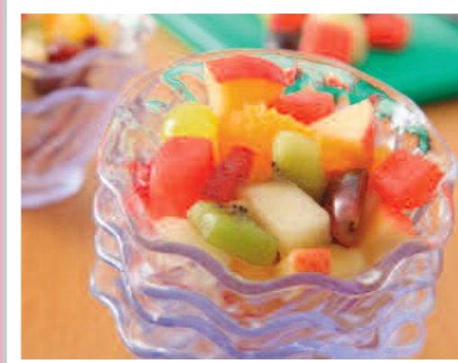
Fresh Fruit Salad