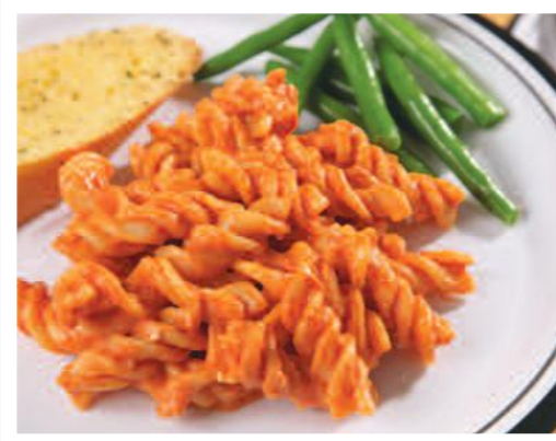
Tomato & Mascarpone Pasta served with Garlic Bread & Seasonal Vegetables