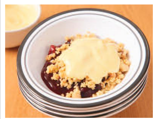
Fruit Crumble & Custard