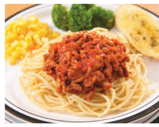
Spaghetti Bolognese served with Garlic Bread & Seasonal Vegetables