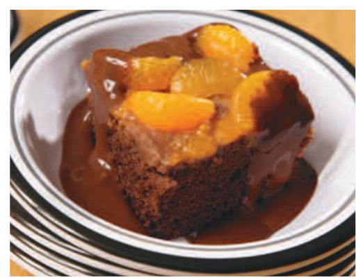
Chocolate Mandarin Sponge & Custard