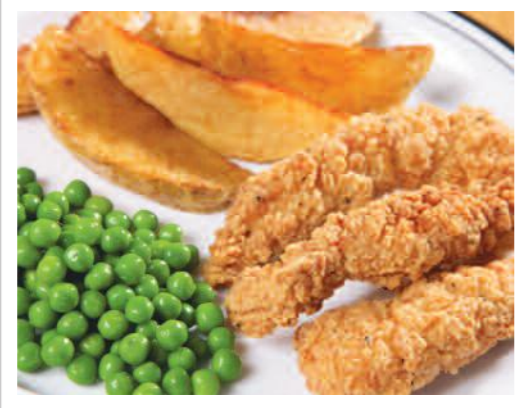
Battered Chicken Strips served with Potato Wedges & Seasonal Vegetables