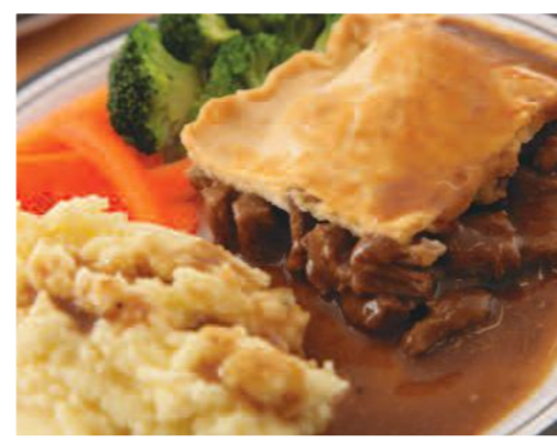
Homemade Steak Pie served with New Potatoes & Seasonal Vegetables