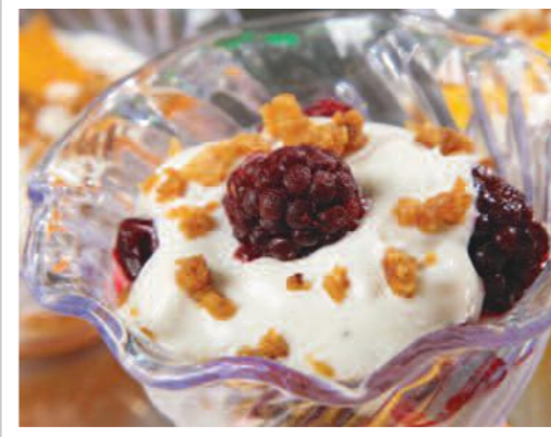
Yoghurt Fruit Crunch