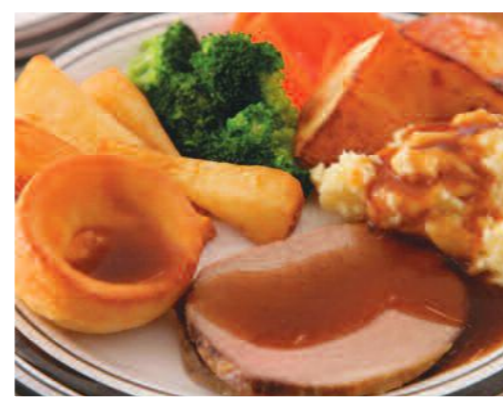
Roast of the Day served with Roast/Mashed Potatoes, Seasonal Vegetables & Gravy