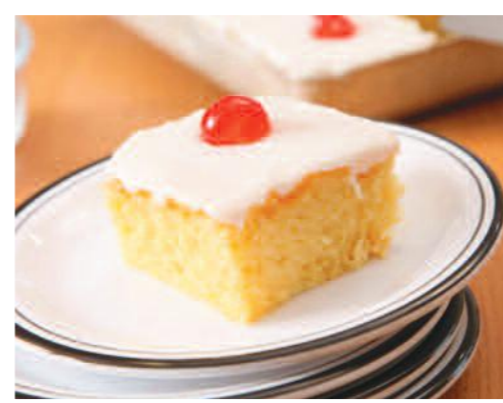
Iced Sponge Cake