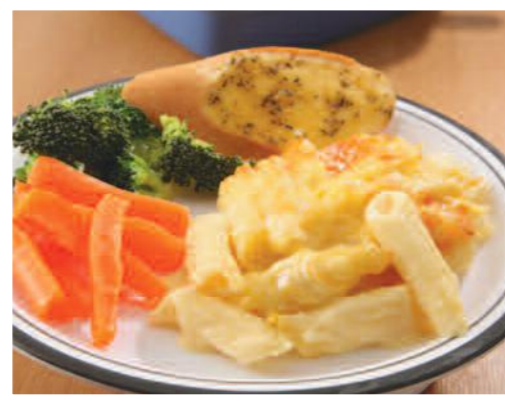
Mac'n'Cheese served with Crusty Bread & Seasonal Vegetables