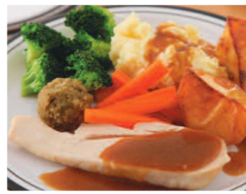
Roast of the Day served with Roast/Mashed Potatoes, Seasonal Vegetables & Gravy