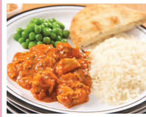
Chicken Tikka Masala served with Rice, Naan Bread & Seasonal Vegetables